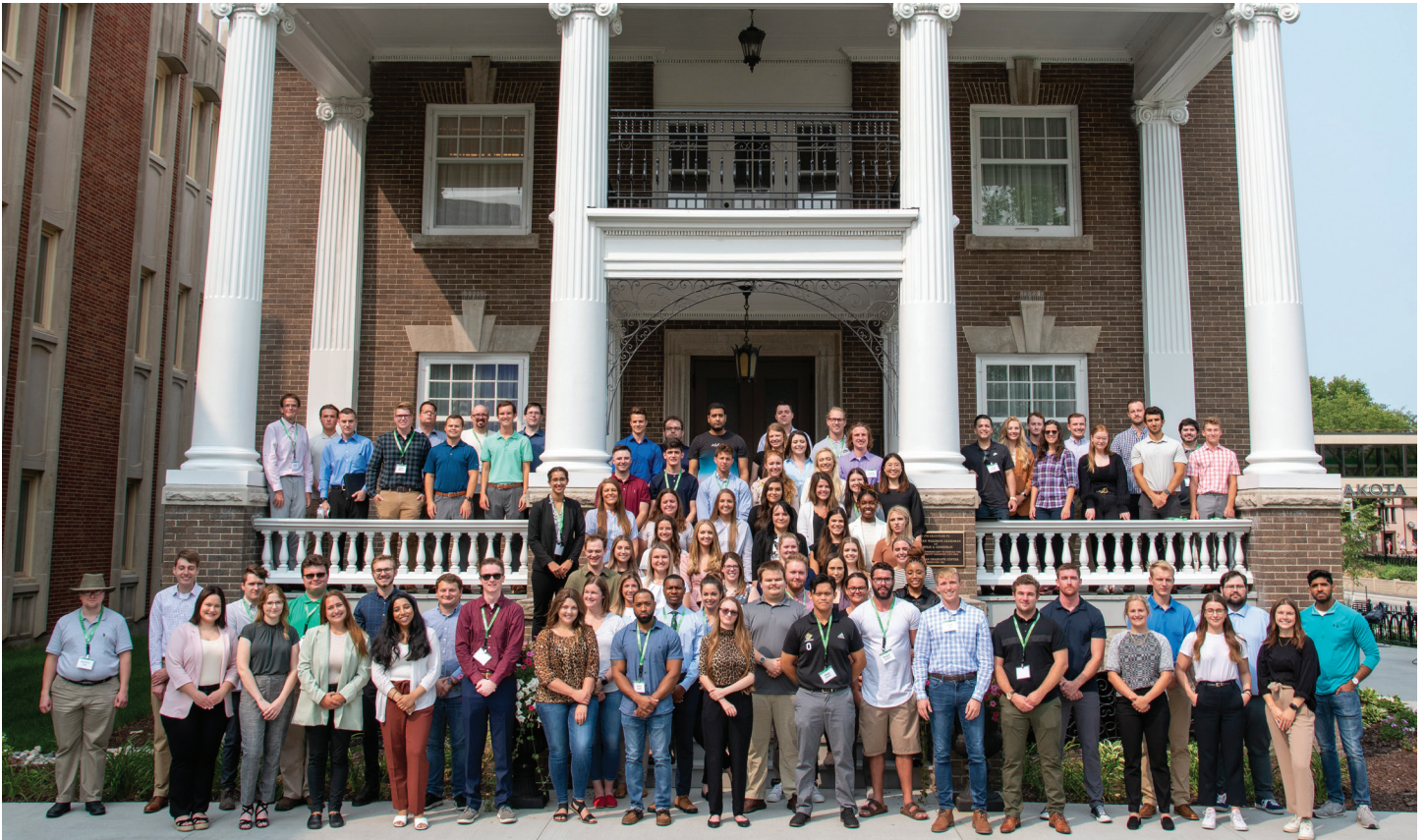
The Class of 2024 during orientation in August 2021.

wish to recognize and thank our family members and friends for the support and encouragement they have given us throughout our law school careers. Without that support and understanding, this would not have been possible.